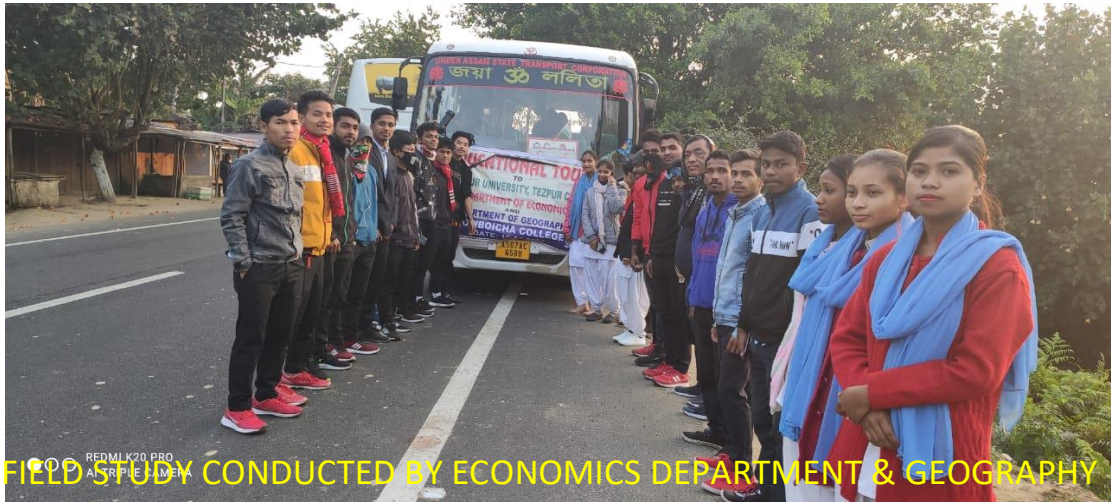
FIELD STUDY CONDUCTED BY ECONOMICS DEPARTMENT & GEOGRAPHY DEPARTMENT